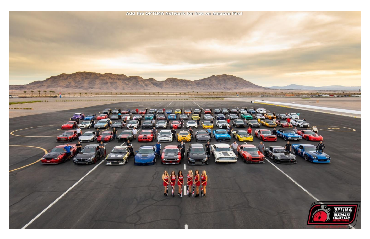
These events are fantastic, if you haven't been you need to come out!