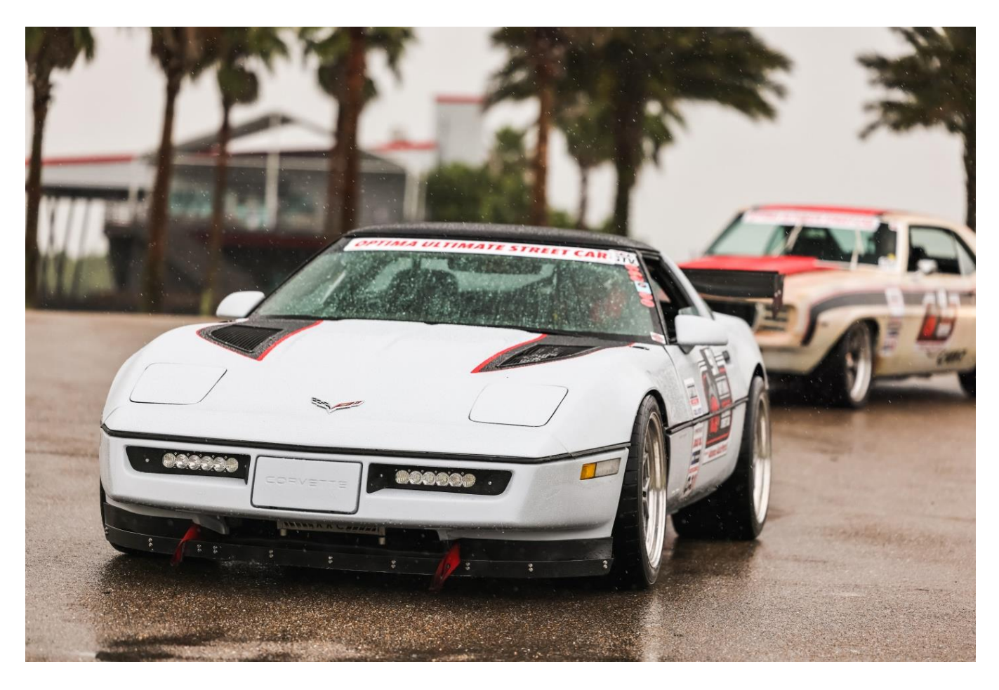
The car needs sponsor stickers too!