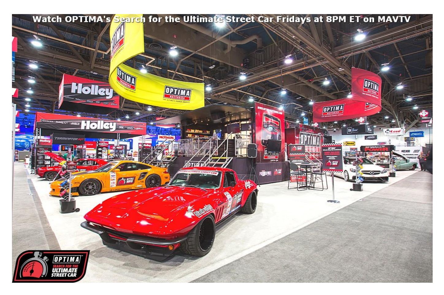
This car will be featured right here at the Optima Center Stage at SEMA 2021, with a sponsor board!